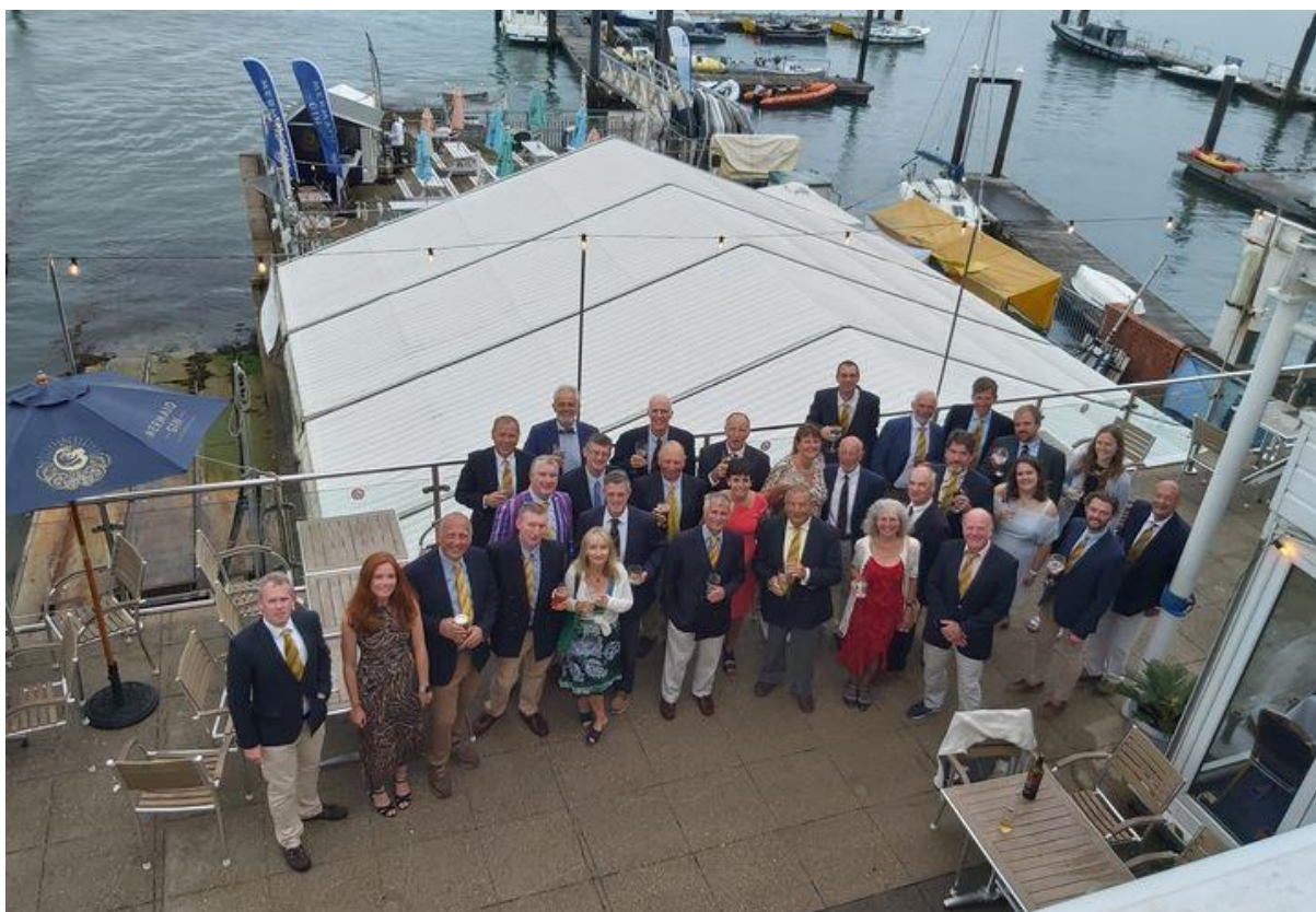
The Victory Class at the Island Sailing Club for the Annual Cowes Week Dinner